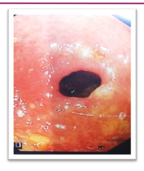
Figure 3: Endoscopy suggestive of a prepyloric diaphragm.