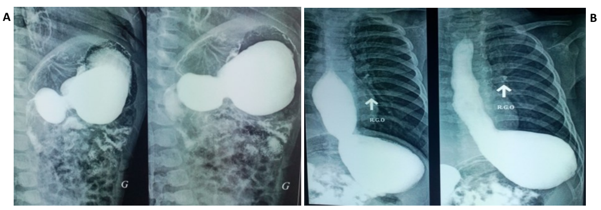
Figure 2: A. upper gastrointestinal series done in our center showing a prepyloric transitional zone, a delayed passage of contrast from the stomach to the duodenum and a distended antropyloric region.

B. Important Reflux with a Dilated stomach and esophagus.