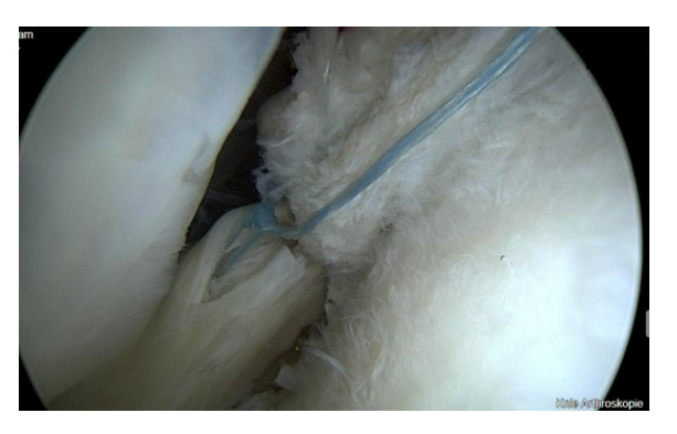
Fig 3. Refixation of the tear was performed using two all-inside repairs: one in the middle third (red -white zone) and one in the inner third (white-white zone). The image shows only the suture in the inner third.