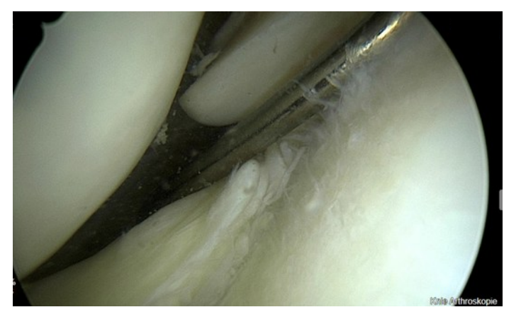
Fig 2. Radial tear of the posterior horn of the lateral meniscus LMORT Type 3.