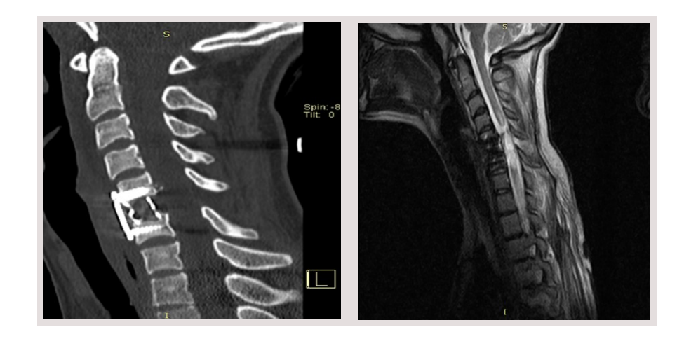
Fig 4: Saggital CT view of the Cervical. Showing the instruments in place from next postoperative day. And 3 months postoperative MRI showing myelopathy at the level of trauma

Postoperative imaging shows preservation of the preoperative reduction. After surgery patient had similar neurological status as to preoperative and was discharged to a rehabilitation facility full ambulatory with a philadelphia cervical collar. 3 months postoperatively the patient made a slight neurological improvement.