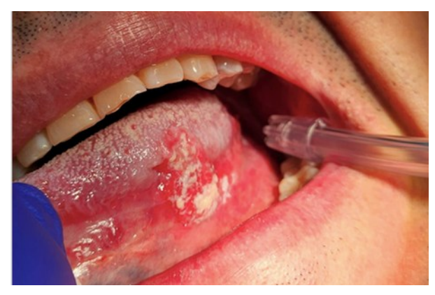
Figure 2. Erythroplakia in lateral border of tongue.