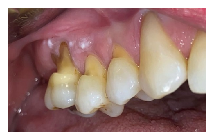
Figure 5. Oral lichen planus in gingiva.

The malignant transformation of oral lichen planus into oral squamous cell carcinoma (OSCC) remains debated: several prospective and retrospective studies discussed this topic and reported rates varying from 0 to 9%.<sup>17</sup>