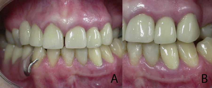
Figure 5: Postoperative result after 21 days of the surgical procedure.